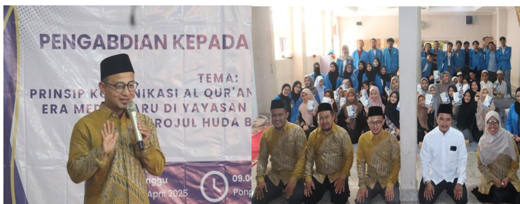
Figure 1: Implementation of counseling activities and photos with participants

The Counseling of the Concept of Communication in the Qur'an was carried out to provide a deep understanding to participants about the urgency of communication in life. Communication is basically one that can bring closer and glue human relationships with others and also with Allah SWT. by applying the principles in the Qur'an in their daily lives, not only good at communicating and rhetoric, but also not paying attention to one's own good morals and what kind of impact will be caused when they finish communicating.