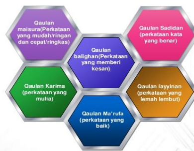
Figure 1 : Presentation Materials